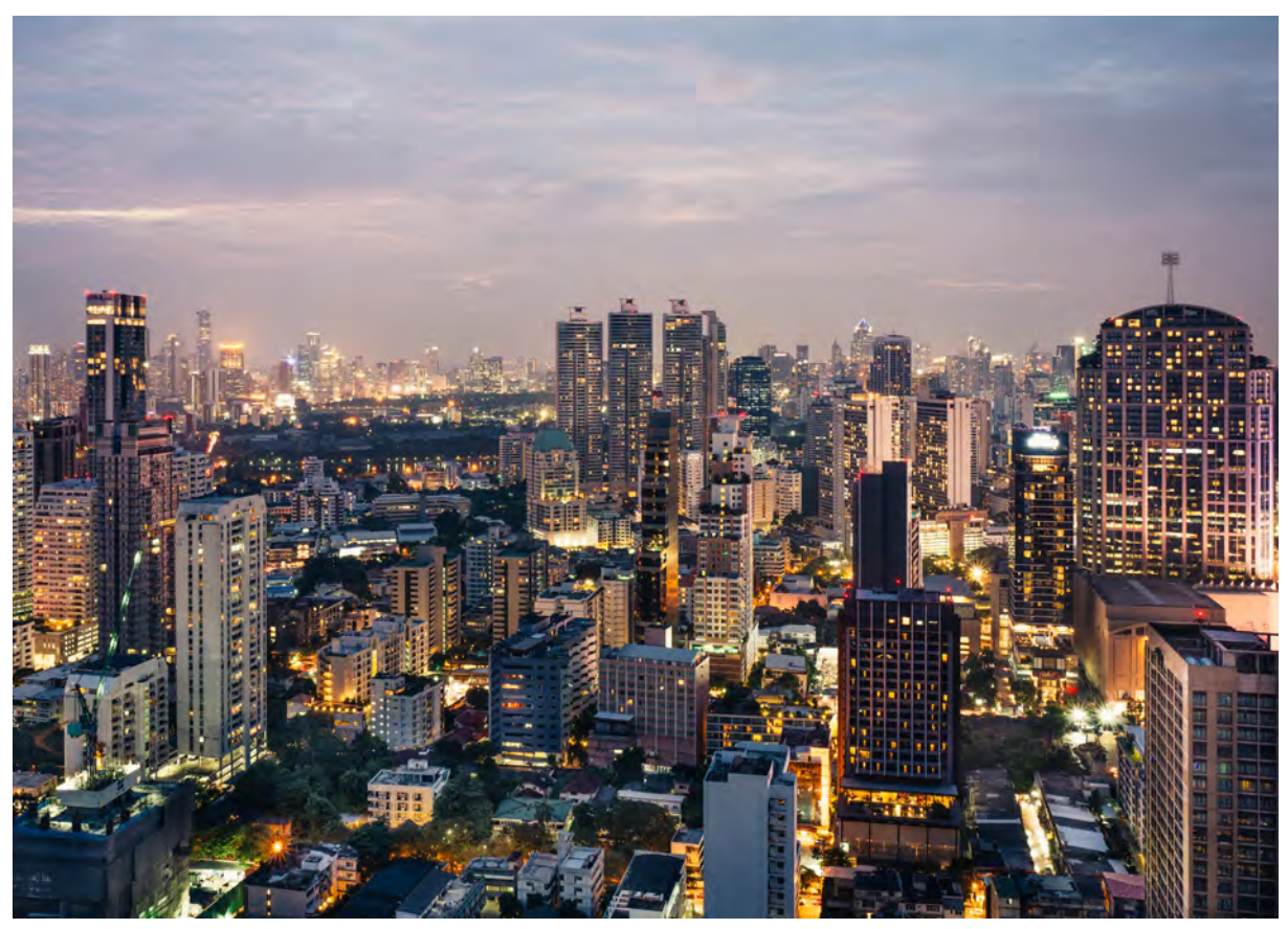
Sukhumvit Road, Thailand